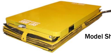
Model Shown: PL3000P