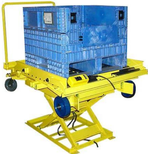
Model Shown: PL3000H