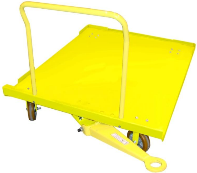
Model Shown: KT2-49NRTS

K-Tec identifies and benchmarks relevant applications, addresses ergo/safety issues and provides on-site feasibility reviews where required. Application engineers are available by conference call or direct appointment to help walk through the early planning and front end design phase of lean material flow projects. 2 K-Tec also designs ergo-support products such as lifts and conveyors to provide an integrated, dependable solution. A "try before you buy" demo program for qualified customers delivers a hands on look at a possible solution without wasting investment dollars.