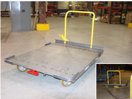
Model Shown: KT2-49NRTS